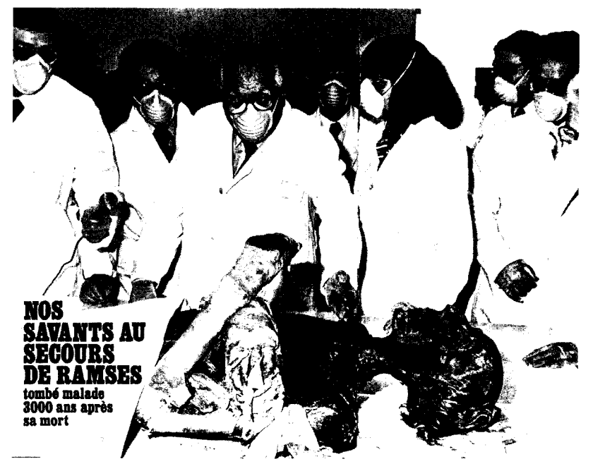
Figure 10.1. Our scientists to the rescue of Ramses II, who fell ill three thousand years after his death. (From Paris Match, September 1956)

the spinal cord that caused extreme pain. Too late for an intervention. But not too late to claim still another triumph for French physicians and surgeons, whose reach has now expanded in remote time as well as in remote space.